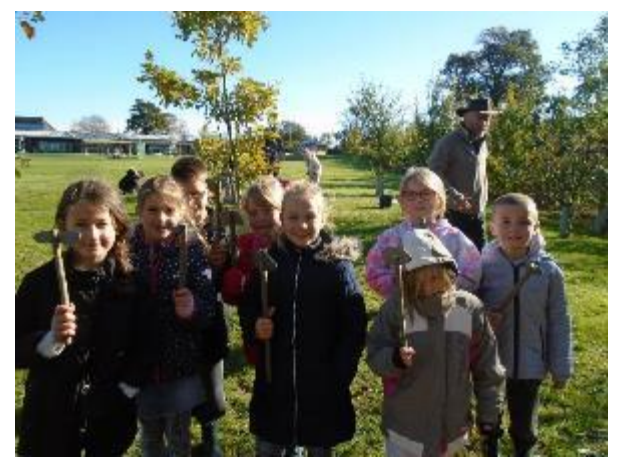
Stone Age Forest School