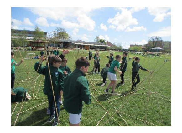
Roman architecture linking design and technology to History.

Design and Technology is an inspiring, rigorous and practical subject. Using creativity and imagination, pupils design and make products that solve real and relevant problems within a variety of contexts, considering their own and others' need wants and values. They acquire a broad range of subject knowledge and draw on disciplines such as mathematics, science, engineering, computing and art. Design and Technology involves applying knowledge and skills when designing and making products. The activities undertaken will enable the children to consider the needs of others within a caring community. Undertaking design and technology activities in school will give the children opportunities to use a range of materials and processes, and to work independently or as part of a team. Cookery is often taught through Design and Technology and in these lessons, children also use English, maths and science in a meaningful context. As well as learning a valuable life skill, the children learn about the importance of a balanced diet and cooking with seasonal produce.