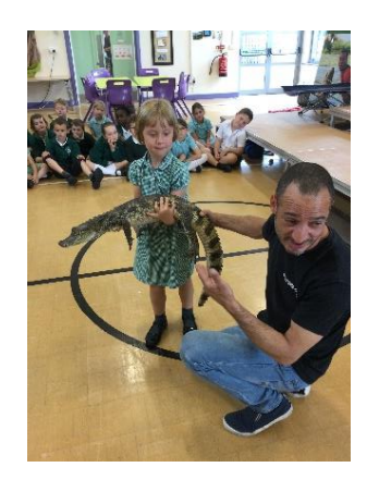
Outside visitors helping children learn about other reptiles as part of their Science and Geography.