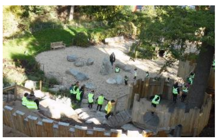
Key Stage One Trip Hever Castle